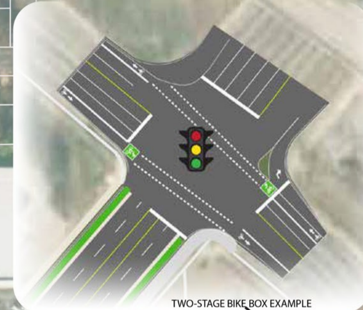
TWO-STAGE BIKE BOX EXAMPLE

Existing Bike Lanes on White Station Road